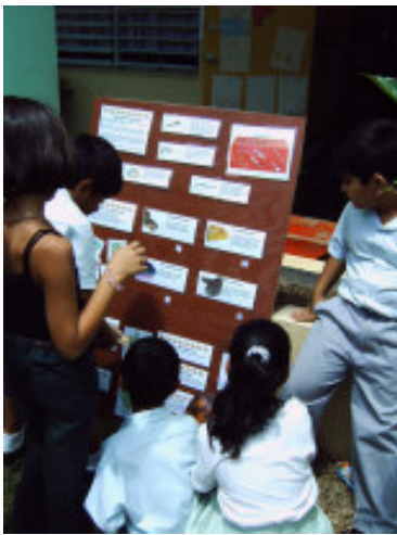
working in a group