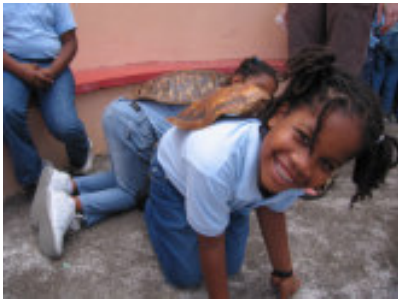
acting like turtles