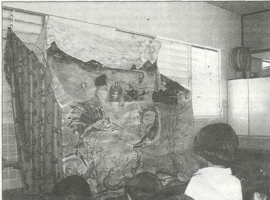
The puppet show backdrop