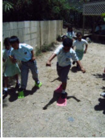
land- and sea turtle race