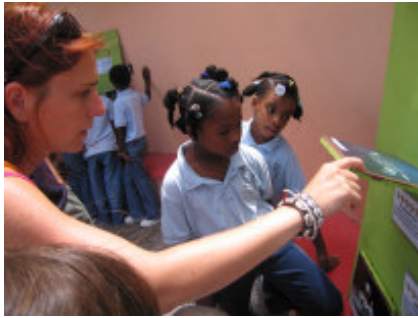
working in a group