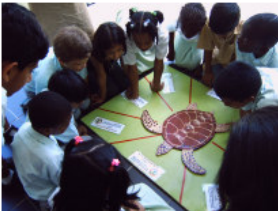
the end game: the turtle of fortune