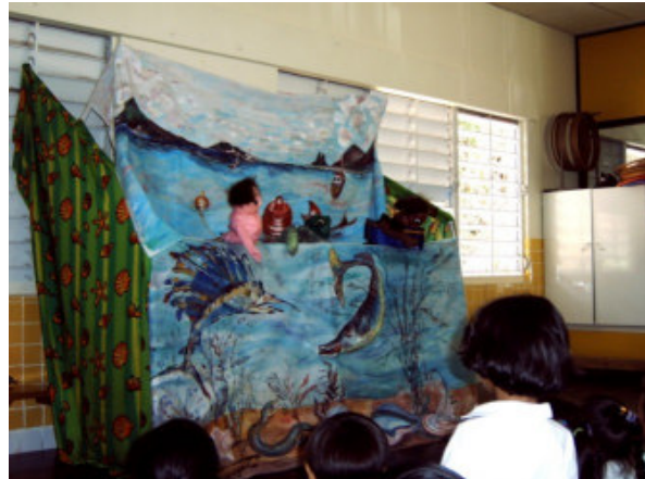
the puppet show